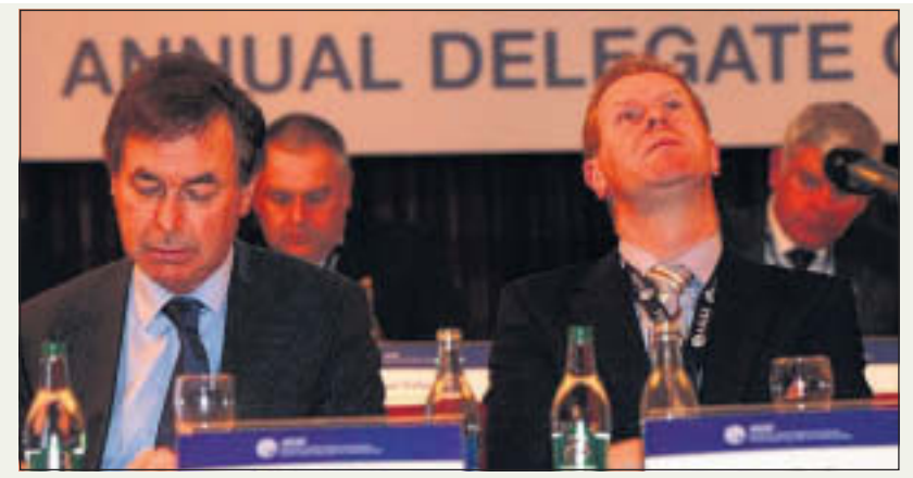
Cool reception . . Fine Gael Deputy greeted with wall of silence by delegates