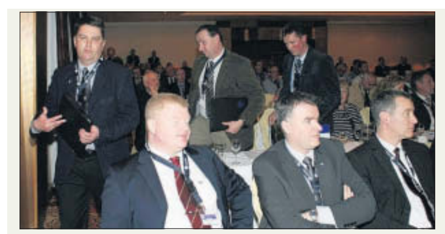
We've had enough . . members of Carlow/Kilkenny branch exit the room